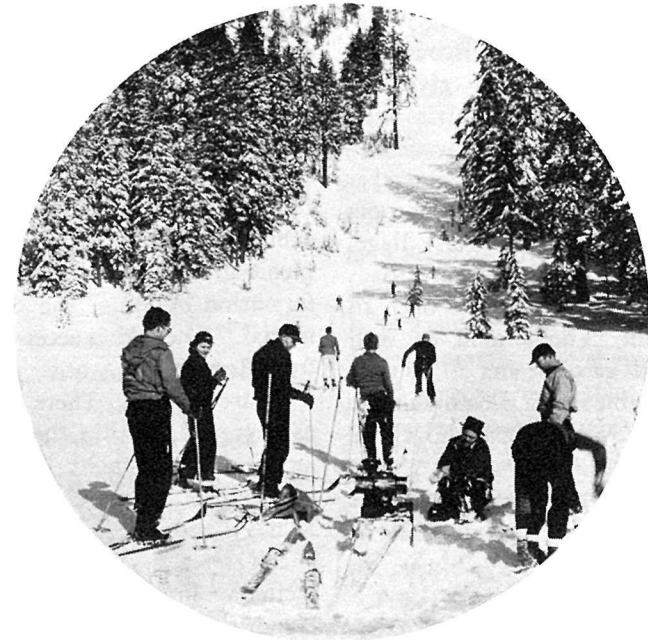
Natural ski run cut by old rock slide.

OTHER PLACES OF INTEREST IN THE PARK AND VICINITY. Hillman Peak,