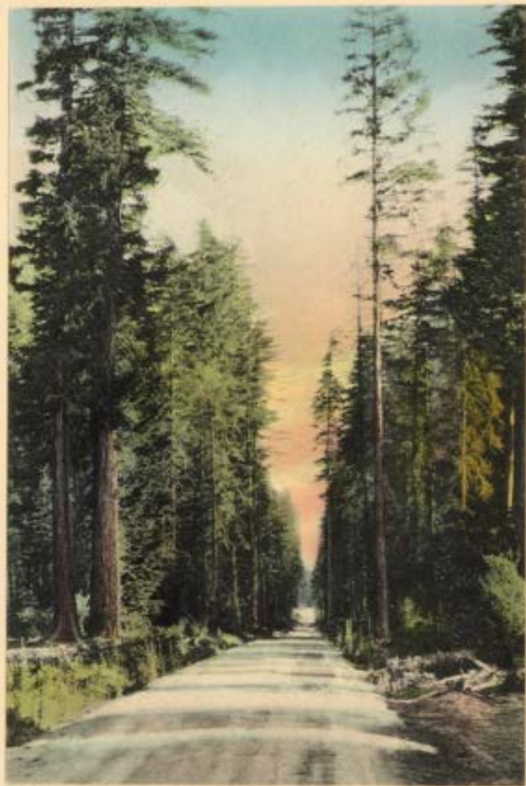
CRATER LAKE HIGHWAY.