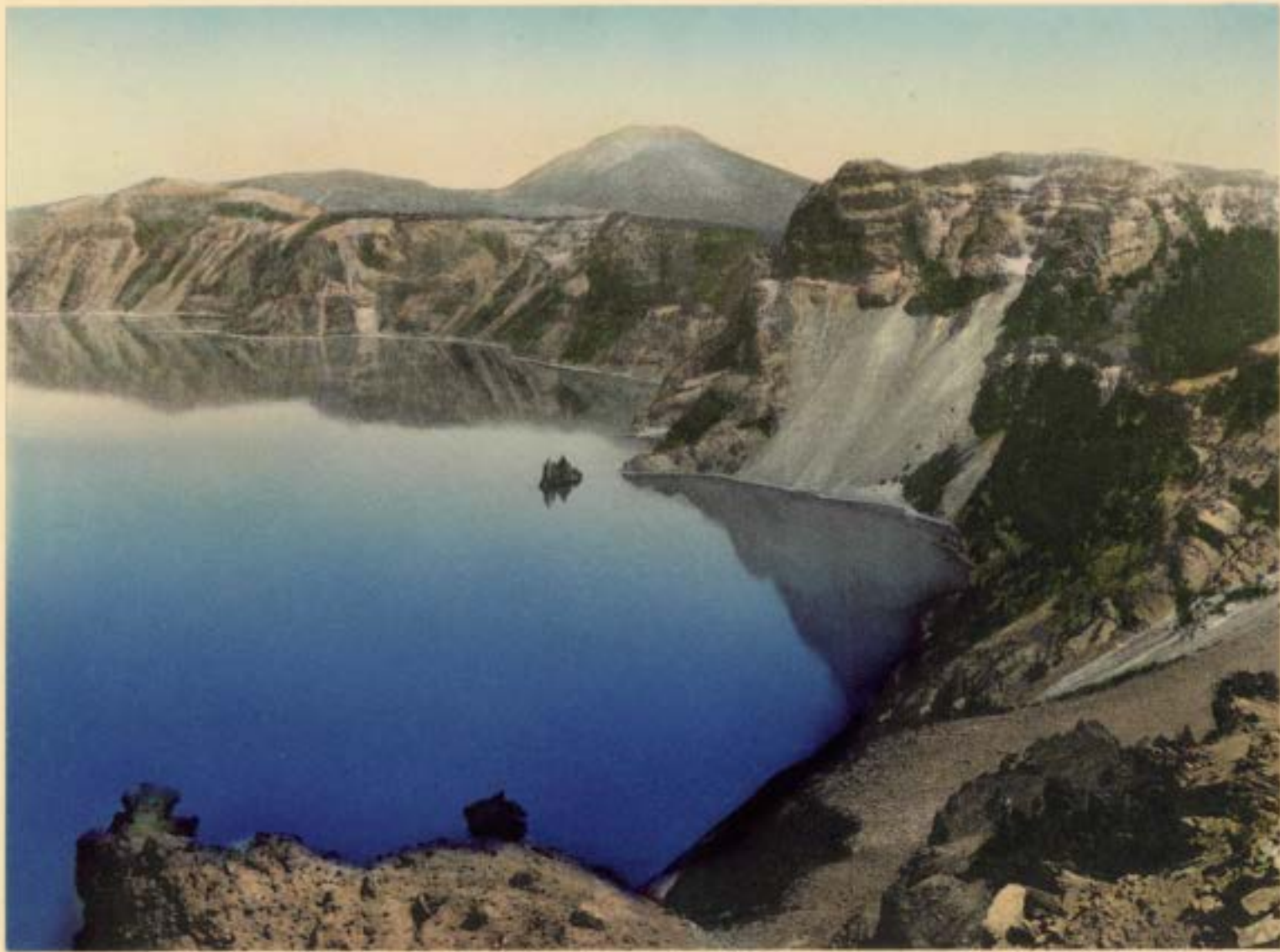
VIEW FROM GARFIELD PEAK.