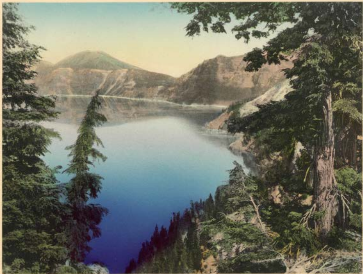
A GLIMPSE OF MOUNT SCOTT.