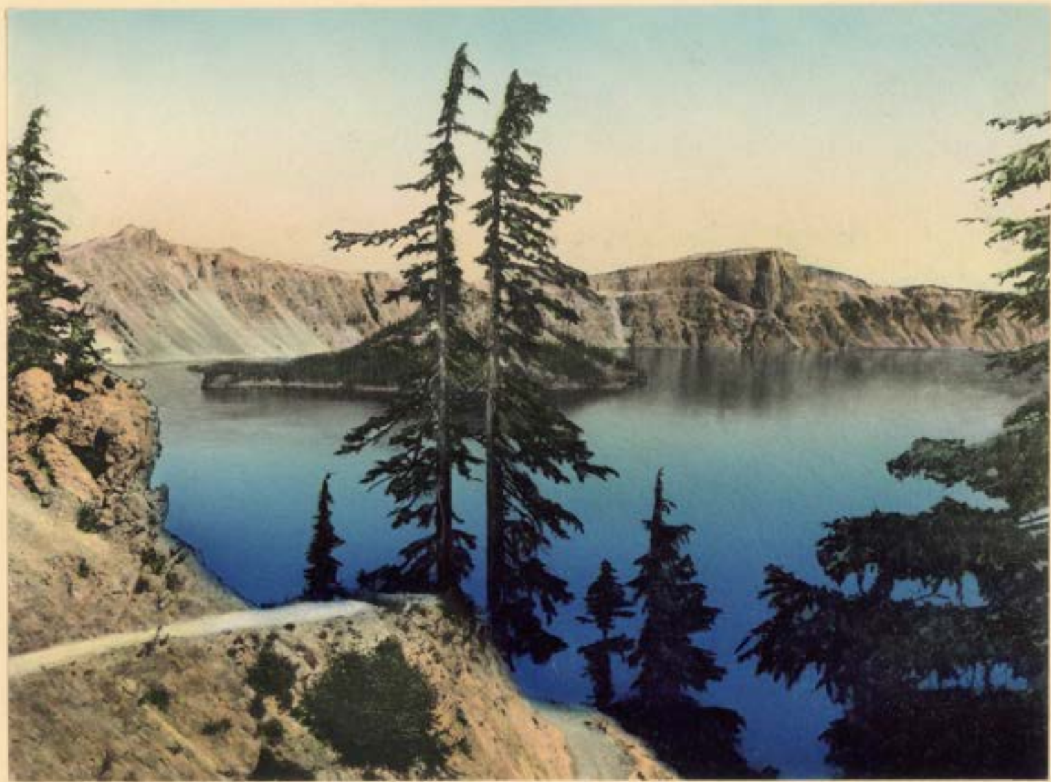
TRAIL TO THE LAKE.