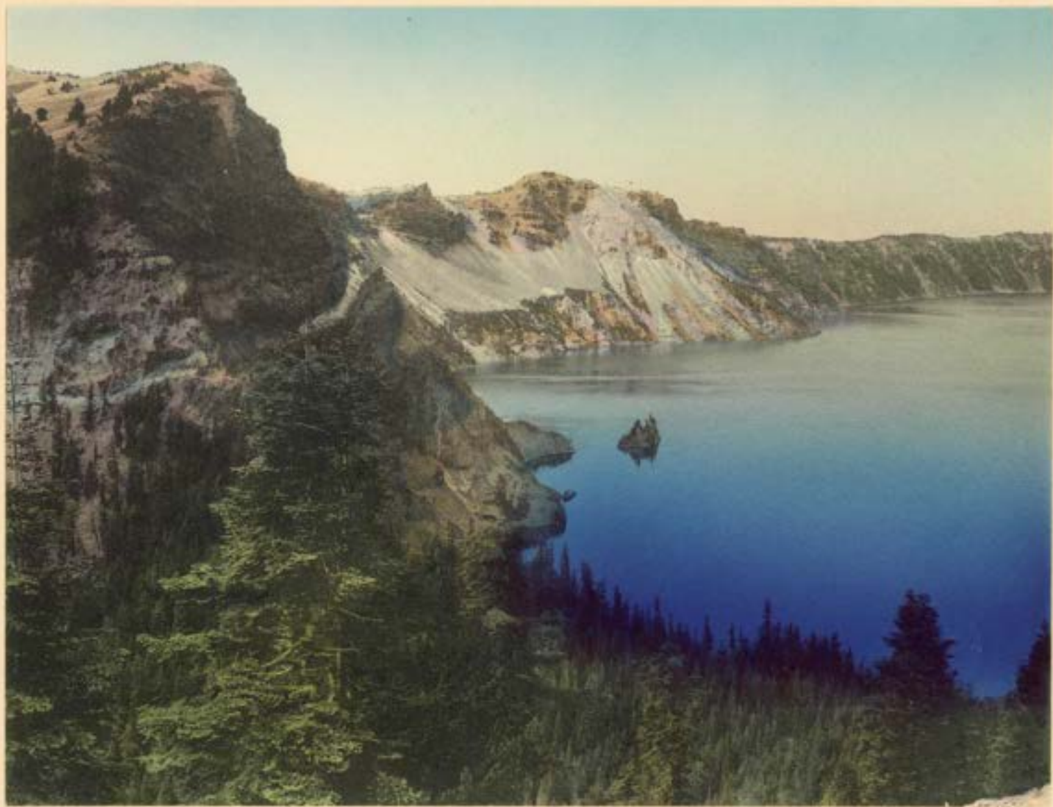
GARFIELD PEAK AND PHANTOM SHIP FROM RIM ROAD.