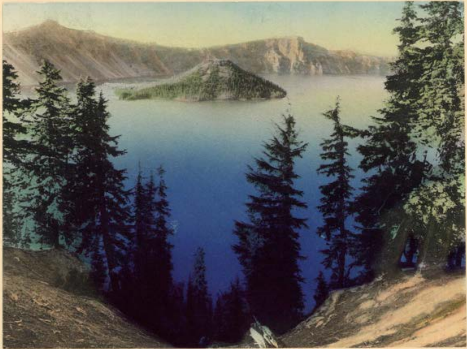
GLACIER PEAK, WIZARD ISLAND, LLAO ROCK AND MT. THIELSON.