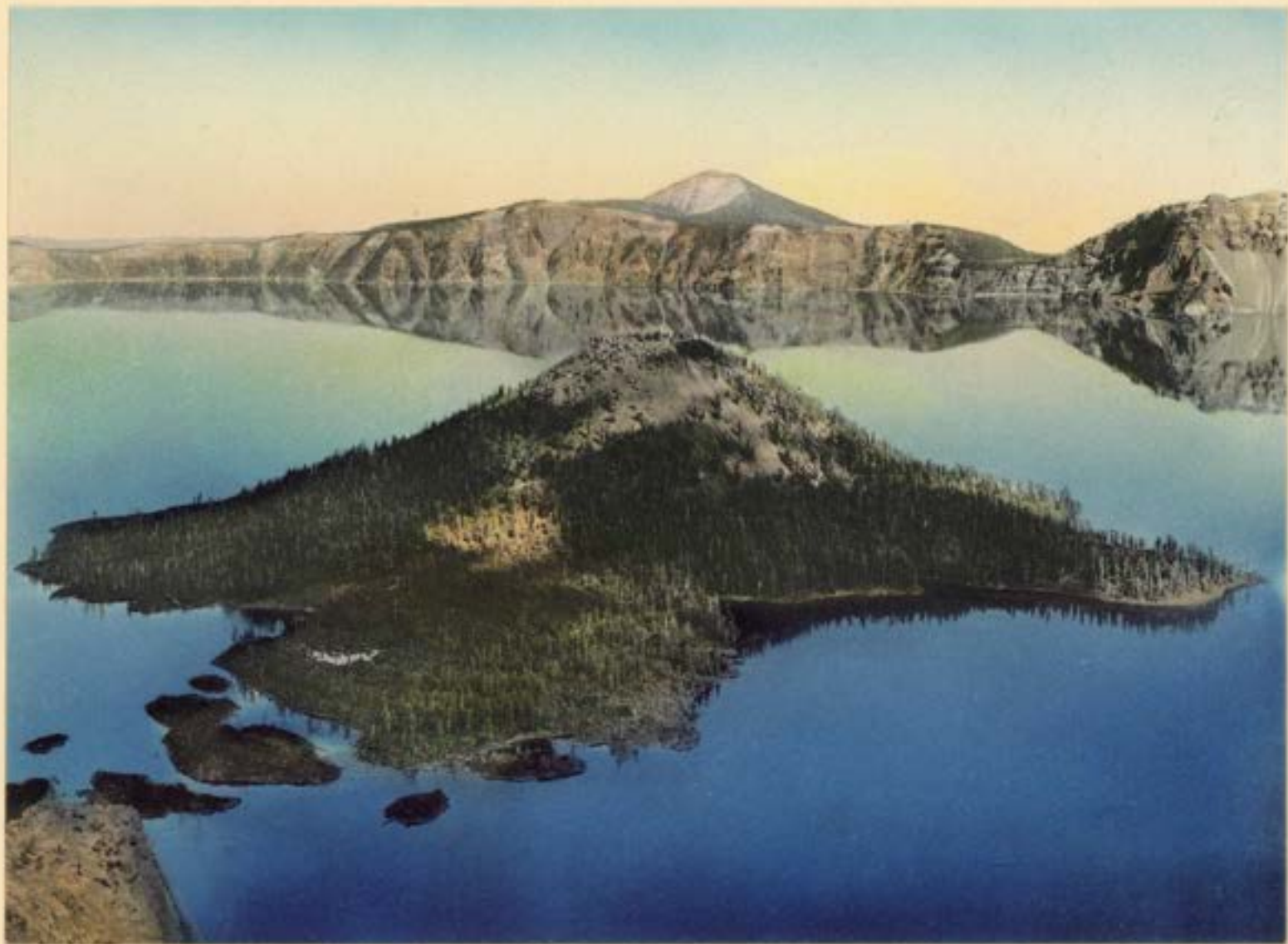
WIZARD ISLAND FROM RIM ROAD.