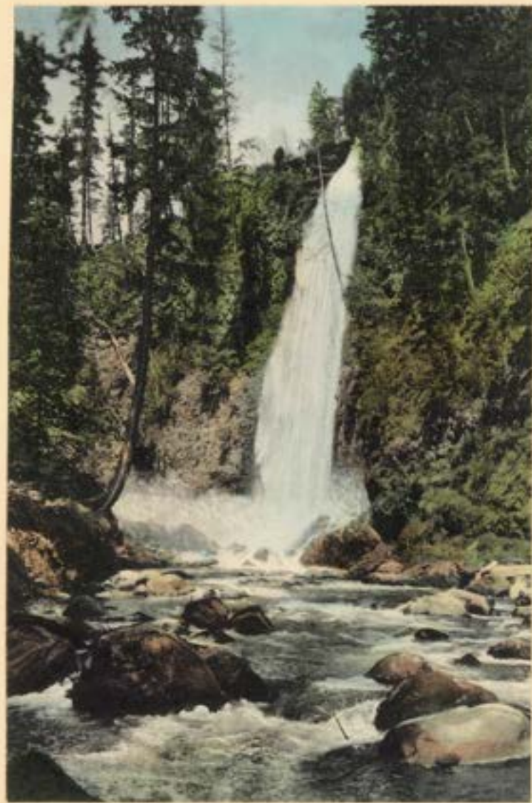
MILL CREEK FALLS.